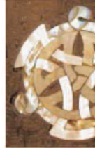
Exquisite shell and wood inlays available