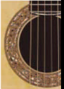
All Carruth guitars feature a unique Celtic pattern rosette