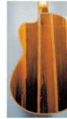
Beautiful purfling, exotic woods available